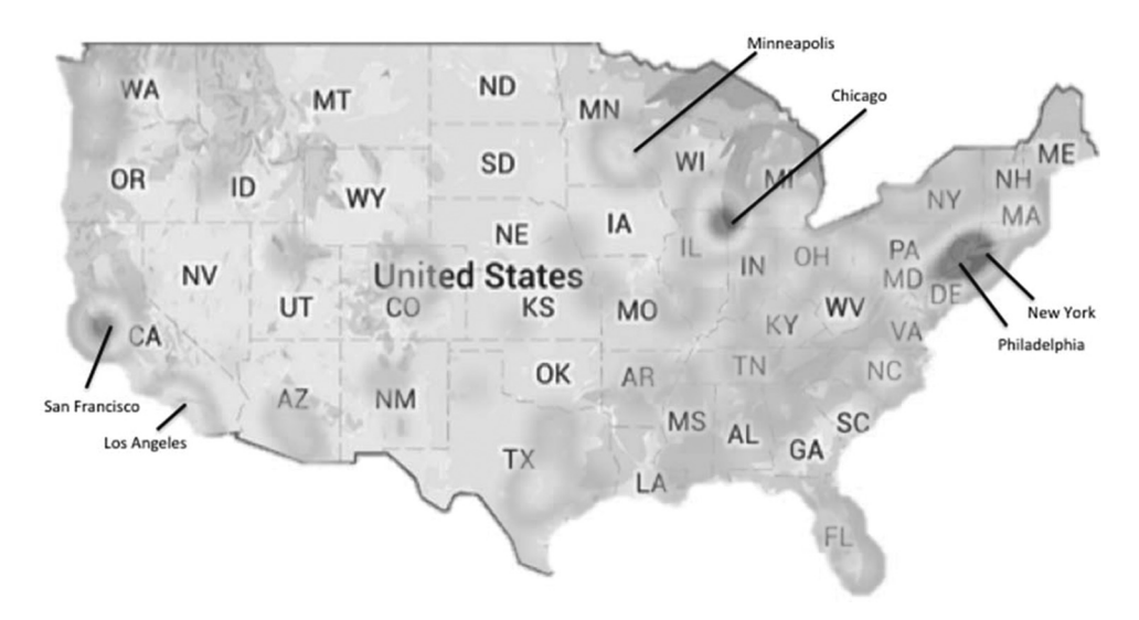
FIGURE 4 Density map of BSM providers by city in the United States.