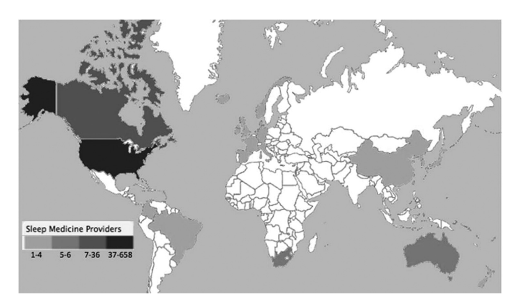
FIGURE 1 World map of BSM provider locations.

Although the United States contains the vast majority of CBT-I/BSM providers, they are not evenly dispersed across the nation (see Figures 2 and 3). Particular divisions (as defined by the U.S. census bureau) are relatively underserved. The nine divisions that comprise the entire United States, as defined by the U.S. census bureau, include New England, Middle Atlantic, South Atlantic, East North Central, East South Central, West North Central, West South Central, Mountain, and Pacific. Of these divisions, the East South Central (KY, TN, MS, and AL) is the most underserved, with only n = 29 of the 659 total BSM providers in the United States. In contrast, the Middle Atlantic division (NY, PA, NJ) contains the most BSM providers (n = 117), despite being composed of only 3 states. The Pacific (CA, WA, and OR), South Atlantic (WV, MD, DC, DE, VA, NC, SC, GA, and FL) and East North Central (OH, MI, IN, IL, and WI) divisions also have a relatively high number of BSM providers (108, 101, and 101, respectively). See Table 2 for a list of divisions organized by number of BSM providers.